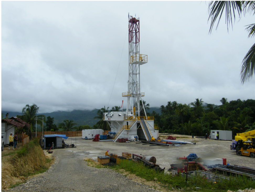
Gas2Grid's Rig-2 based in Philippines

With management's many years of working experience in Philippines, new ventures in that country present good potential for the Company to generate growth in a relatively low cost environment and in short time frame whilst using the Company's 100% owned drilling rig to drill for equity.