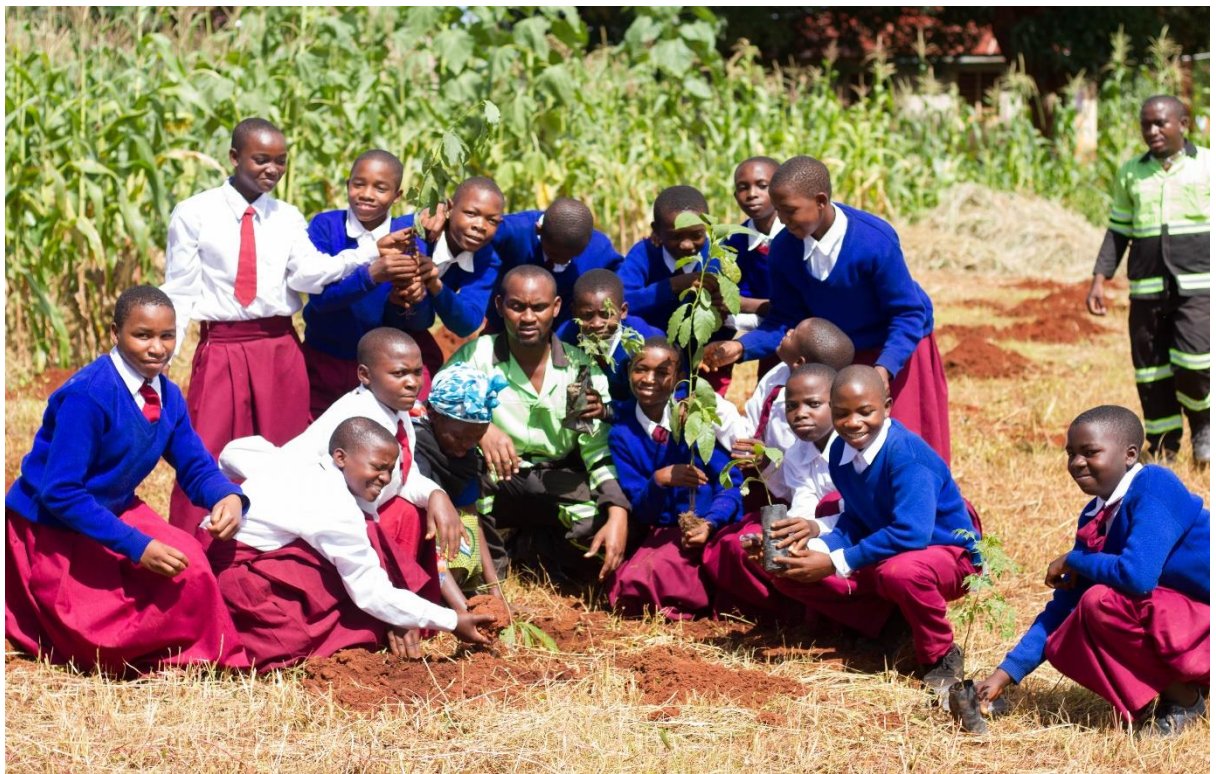
Litetema Secondary School Students participated in Tree Planting exercise