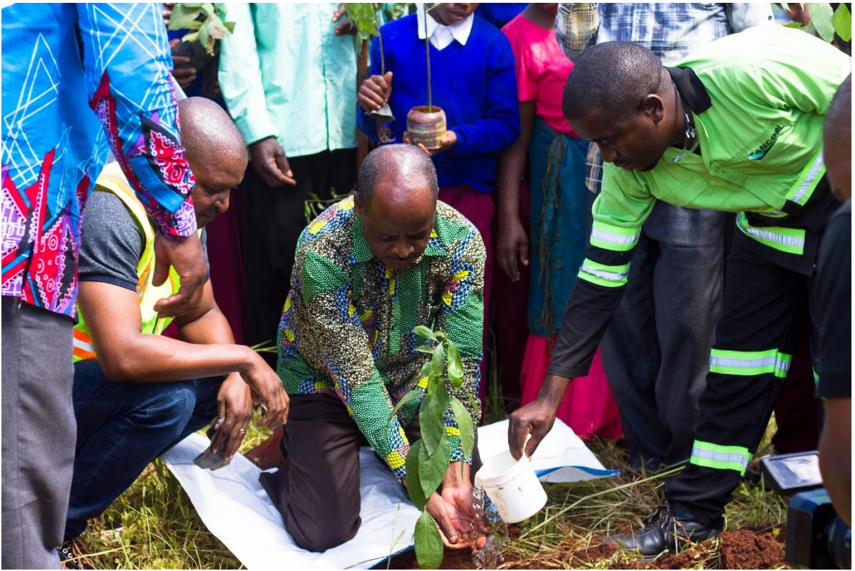
Mbinga District Commissioner Hon. Cosmas Nshenye Planting the tree during the Tree Transplanting Launch at Amani Makolo Village