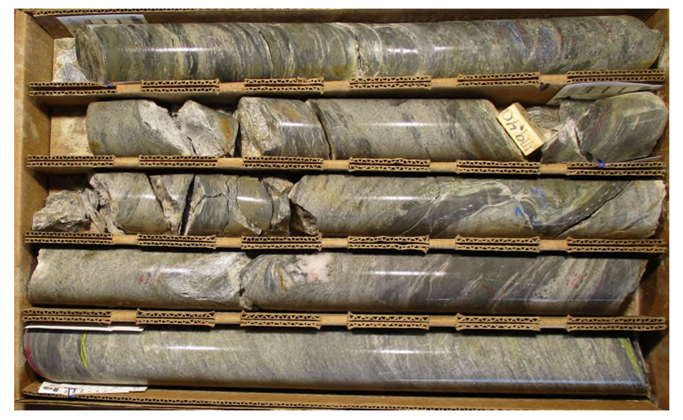
Figure 4: Massive sulphide mineralised interception at hole BMZ79 from 417.3m to 420.28m downhole depth. Sulphide mineralisation both follows cross-cut primary foliation in the hosting rhyolite rock. Sphalerite is pale brown; chalcopyrite bright yellow. Pyrite completes the visible sulphide assemblage