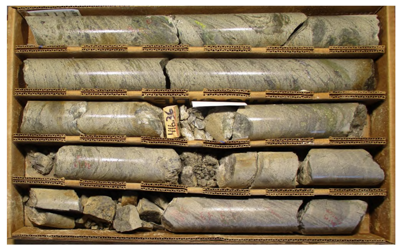
Figure 3: Massive sulphide mineralised interception at hole BMZ79 from 414.96m to 417.30m downhole depth corresponding to the highest zinc grade interval returned by this hole, 3.05m at 49.60% zinc, 1.39% copper, 0.91 g/t gold and 30 g/t silver from 414.65m. Massive Sulphide mineralisation mostly follows primary foliation in the hosting rhyolite rock. Sphalerite is pale brown; chalcopyrite bright yellow. Pyrite completes the visible sulphide assemblage.